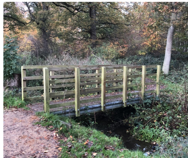
Example image of bridge in Woodland walk - Felbrigg Hall