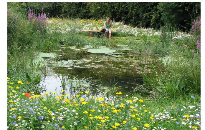
Example image of pond feature